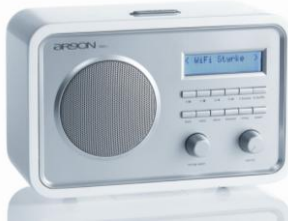
High gloss white