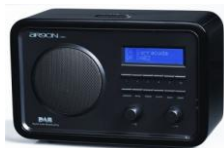
High gloss black