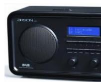
High gloss black