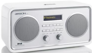
High gloss white